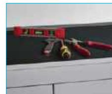
Dished top available on half height cupboard.