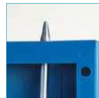
Three point locking for secure storage.