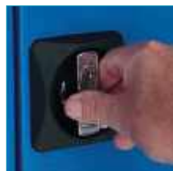
Handle is designed for easier operation; allowing the door to close without the key.

All painted components are protected with a powder coating which incorporates ActiveCoat anti-bacterial technology.